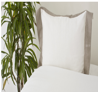
Pillow Sham with Border